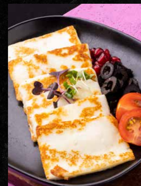
Grilled Halloumi 31.00 Grilled Halloumi cheese, zaatar pesto, cherry tomato, black olives